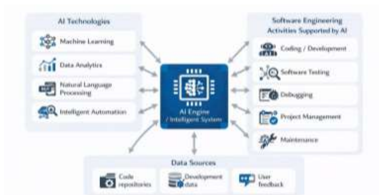
Figure 2. Conceptual framework showing how AI technologies support software engineering processes.

The framework shows how AI technologies such as machine learning, data analytics, and intelligent automation work with the software development environment. AI systems examine code repositories, development data, and user feedback to assist developers with coding, testing, debugging, and project management tasks.